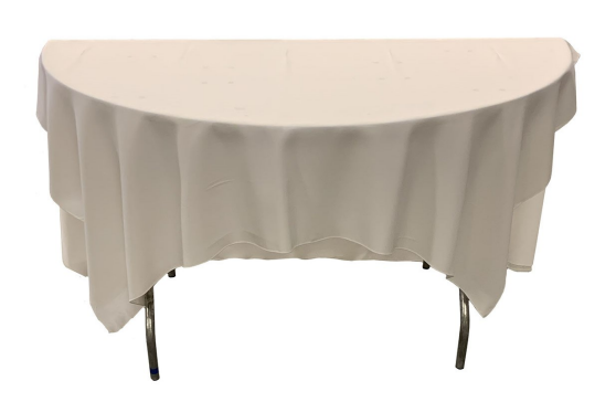
Use a 120" round linen folded not quite in half and hold it in place with clips. The 120" round will not cover the back of the table.